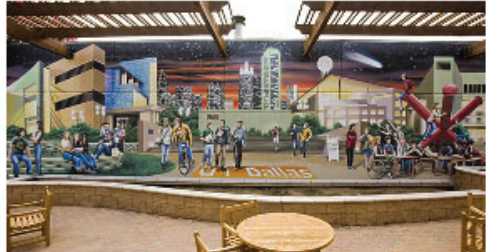
STUDENT UNION MURAL